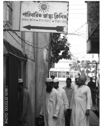
As part of their training Imams take field trips to Smiling Sun Clinics.

The Imam’s response to the collaboration has been overwhelmingly positive. They have allowed NSDP to use the mosques’ loudspeakers to publicize the dates and services available at the Smiling Sun satellite clinic sessions and promote special events like National Immunization Day, Safe Motherhood Day, and World Breastfeeding Day. These announcements have been effective because Bangladeshis readily accept information coming from the mosque. Many Imams participated in NSDP’s World AIDS Day events and distributed information on HIV/AIDS and sexually transmitted diseases.