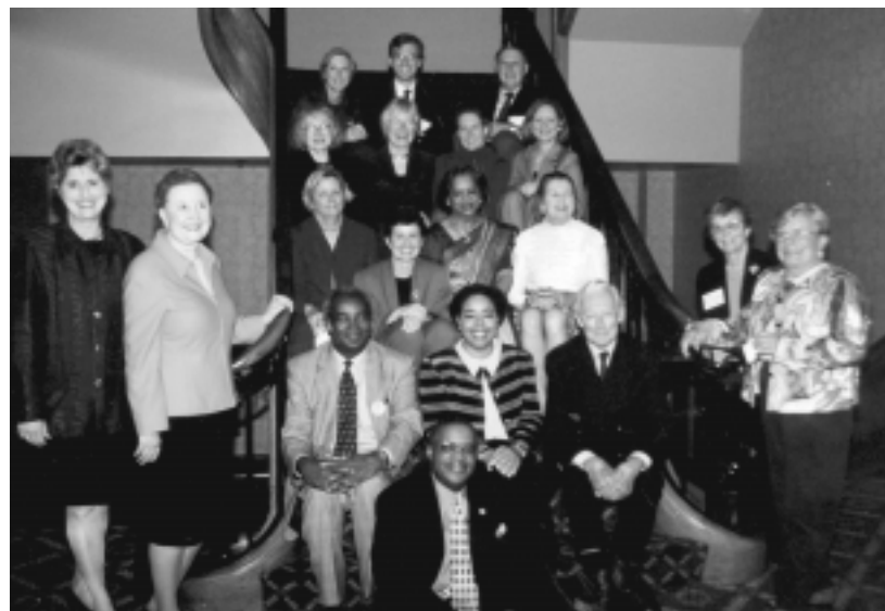
Pathfinder International's Board of Directors

The White House's refusal to release the funds stems from allegations that UNFPA supports China's coercive abortion and sterilization policies, despite findings to the contrary by the U.S. Agency for International Development and other international agencies. The Bush Administration's own State Department fact-finding mission returned from China with no evidence that the UNFPA "knowingly supported or participated in...coercive abortion or involuntary sterilization." Subsequent legislative attempts on Capitol Hill