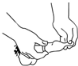
1. Unroll condom on erect penis.